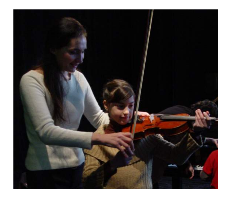
Bright Stars Summer Academy hosted nearly forty students in music classes for handbells, Arabic choir, and contemporary music appreciation.